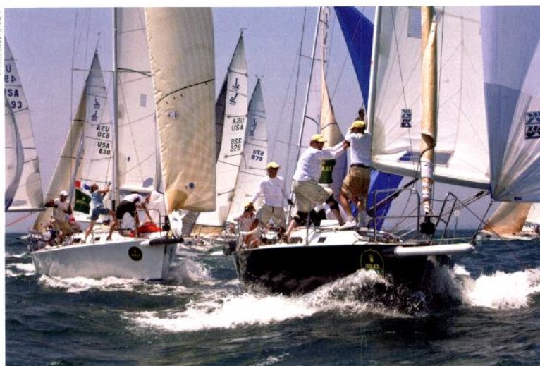
7/13/12. COMPETING IN ONE-DESIGN RACES DURING THE 2010 RACE WEEK

It happens every two years. NYYC Race Week at Newport presented by Rolex returns to Harbour Court Saturday, July 14 th for 9 days of exciting racing plus a little socializing with sailors from across the country. The Bastille Day start features two days of competition among Classic 12 Metre, 6 Metre, and Herreshoff “S” class yachts. On Wednesday there will be the usual race around lovely Conanicut Island that is open to all yachts at no fee. Thursday to Sunday will see big-time racing among the One-Design and IRC classes plus the lively competition in the J/105, Melges 32 classes and PHRF “Navigator Races” on Saturday and Sunday.