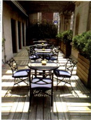
THE WARDROOM TERRACE WITH A NEW LOOK!

We will be welcoming everyone back from a summer of yachting with a festive First Thursday celebration at 1830 on September 6 th when Young Members will kick off the start of their fall season on the newly renovated Wardroom Terrace (weather permitting). Subsequent First Thursdays sponsored by the Young Members Committee during the calendar year, to which members of all ages and non-member guests are always