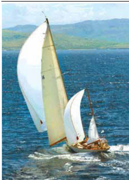
'Dorade' — see Letters for the correct pronunciation — at the finish of the 2013 TransPac.