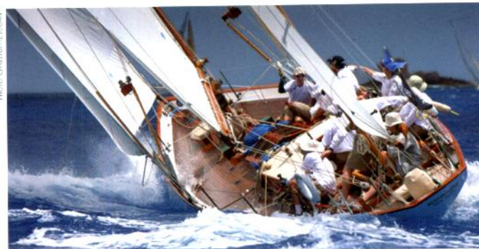
DORADE SAILING IN ST. BARTHS